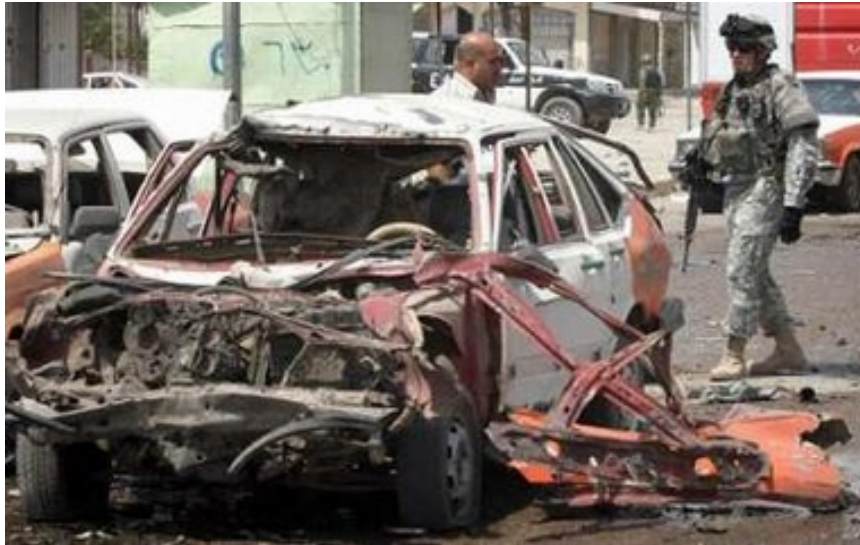
A U.S. soldier walks past a vehicle damaged in a car bomb attack in Kirkuk July 29, 2006.