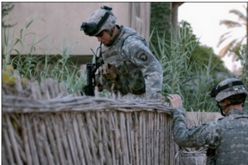
8.4.06: A US soldier in the Dura market of southern Baghdad.