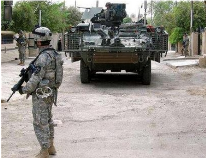
U.S. soldiers patrol in the Dora district in Baghdad, 8.5.06.

REALLY BAD IDEA: NO MISSION; HOPELESS WAR: BRING THEM ALL HOME NOW