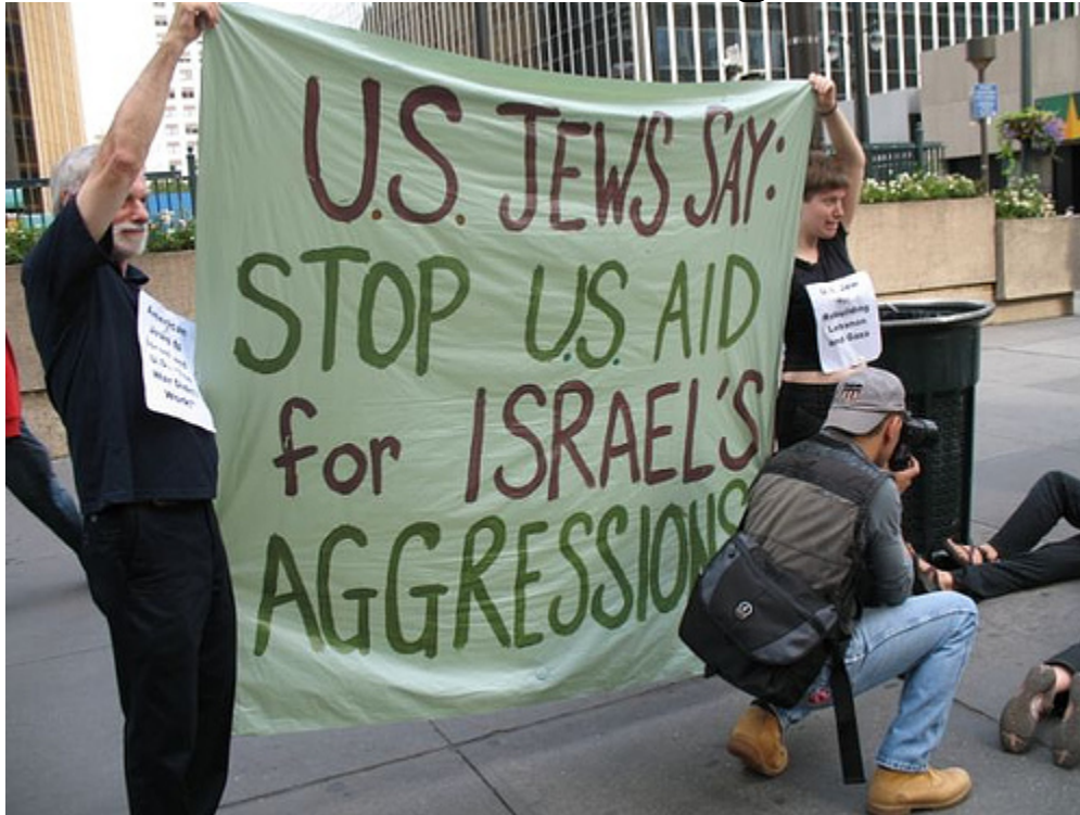
NYC Die-In Images: 08-06