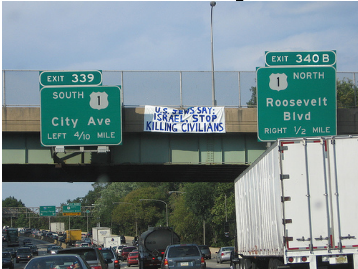
Philly Banner Drop: 8-22-2006 [Jewishconscience.blogspot.com]