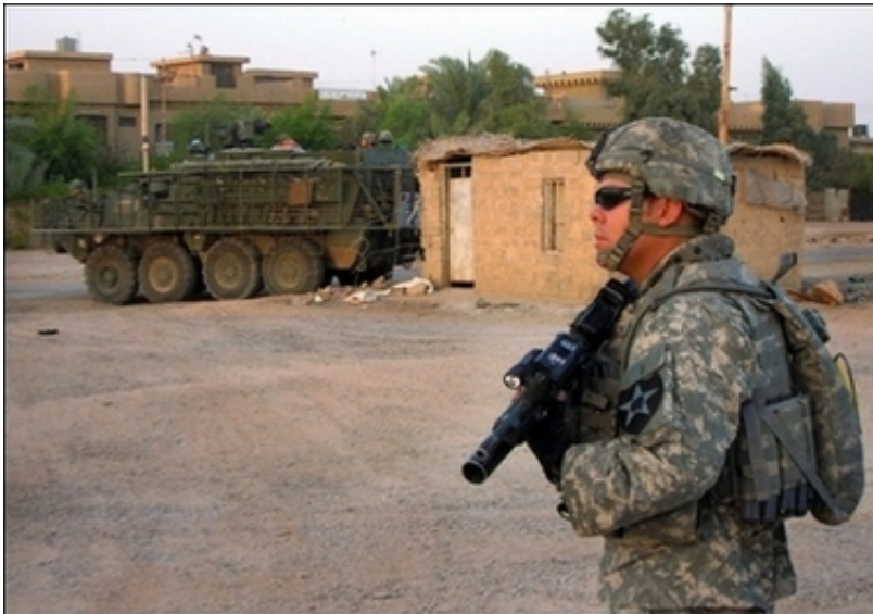
A US soldier patrols a street in Baghdad's Ghazaliya neighborhood, August 15.