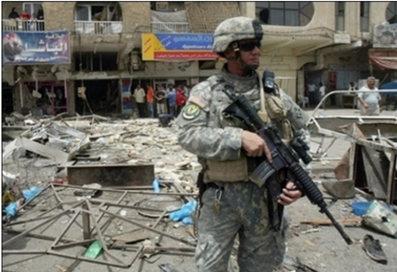
A US soldier at the site of a car bombing near Baghdad's heavily fortified Green Zone.