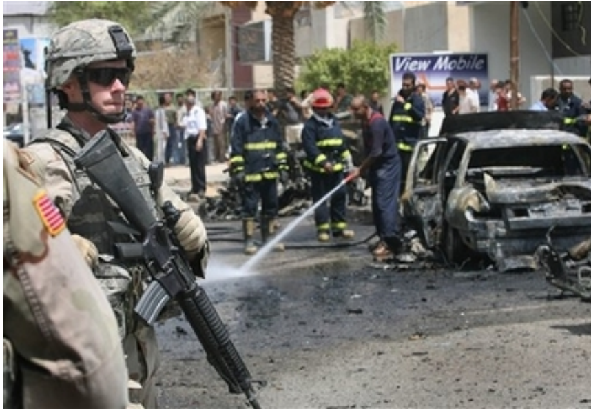
A U.S. soldier at the site of a car bomb explosion, in Baghdad Aug. 24, 2006.