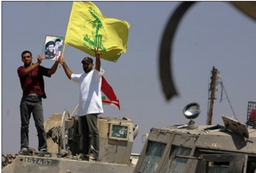
Proud Lebanese stand on an abandoned Israeli army armored personnel carrier 27 August 2006.