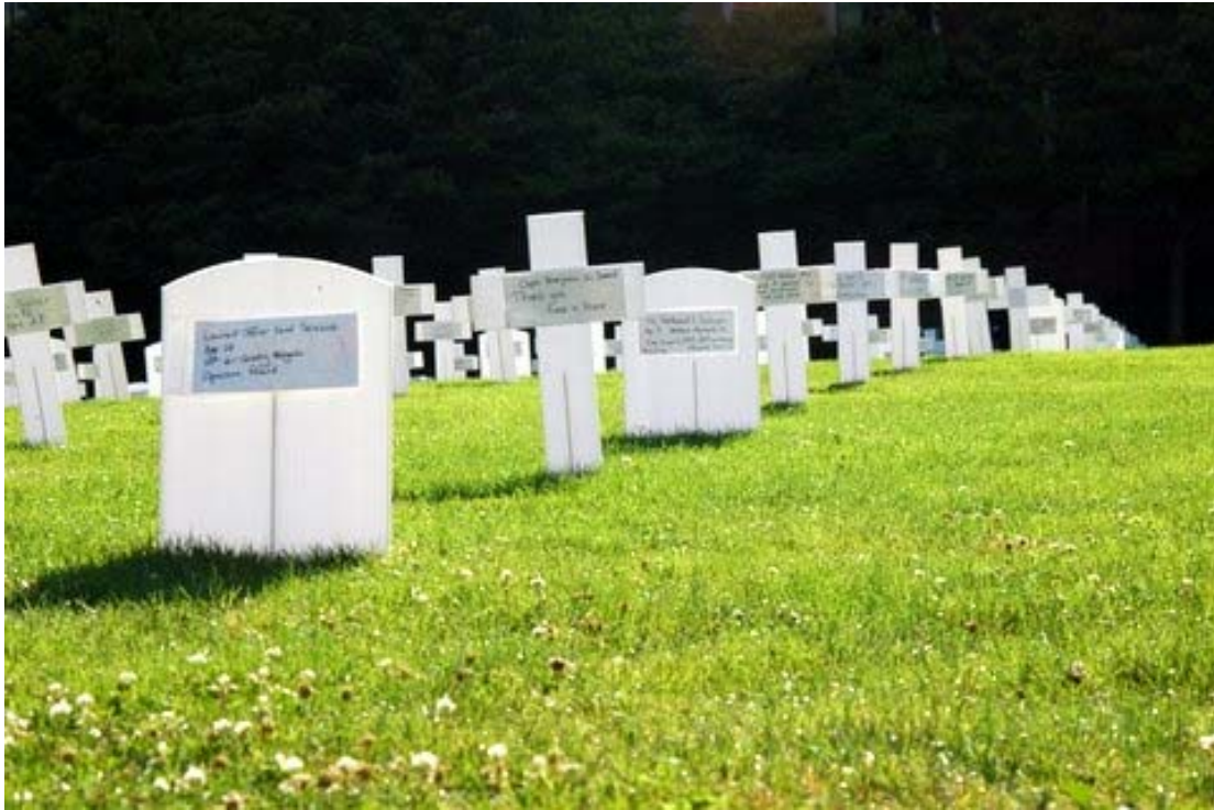
Arlington Northwest in Seattle. 2610 Americans dead in Iraq