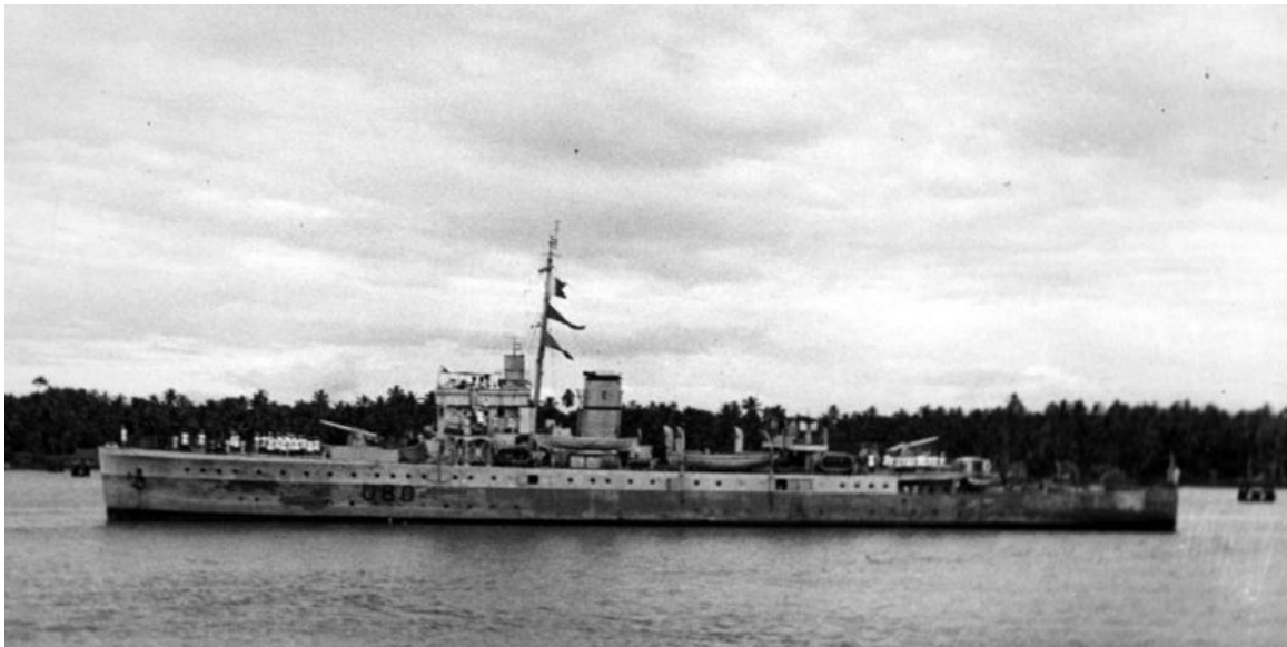
HMIS Hindustan at Bombay Harbour after the war.

The INA trials, the stories of Netaji Subhas Chandra Bose, as well as the stories of INA's fight during the Siege of Imphal and in Burma were seeping into the glaring public-eye at the time. These, received through the wireless sets and the media, fed a disgruntlement and ultimately inspired the sailors to strike.