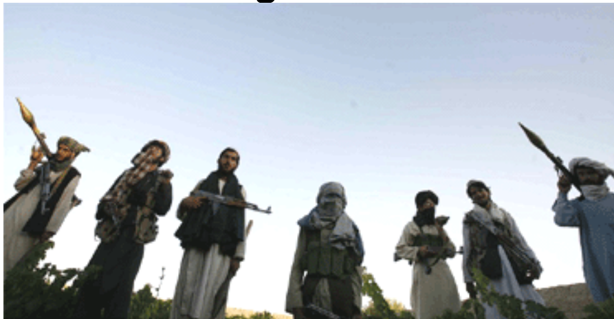
Taliban fighters in Ghazni province in southern Afghanistan.

“If The People Are Disappointed Much More, They Could Unite Against The Foreign Forces”