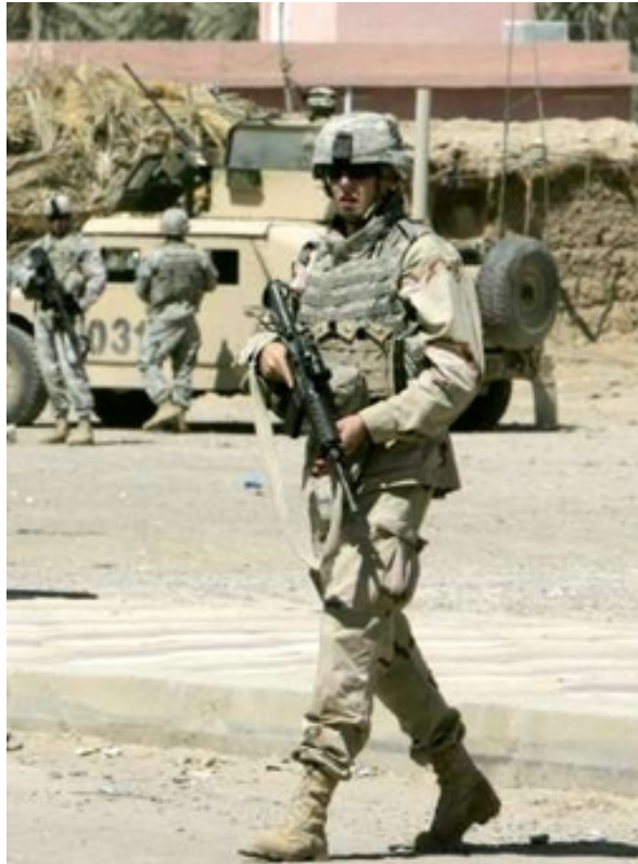
U.S. soldiers from the 1st Brigade Combat Team, 4th Infantry Division in Baghdad September 16, 2006. (IRAQ)