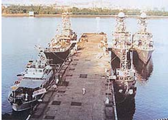
Line-up of ships of the RIN on the Bombay dockyard breakwater during the mutiny.

These questions have remained largely un-answered, and the story of the mutiny of the all but disappeared from the story of modern India as well as the story of her struggle for independence.