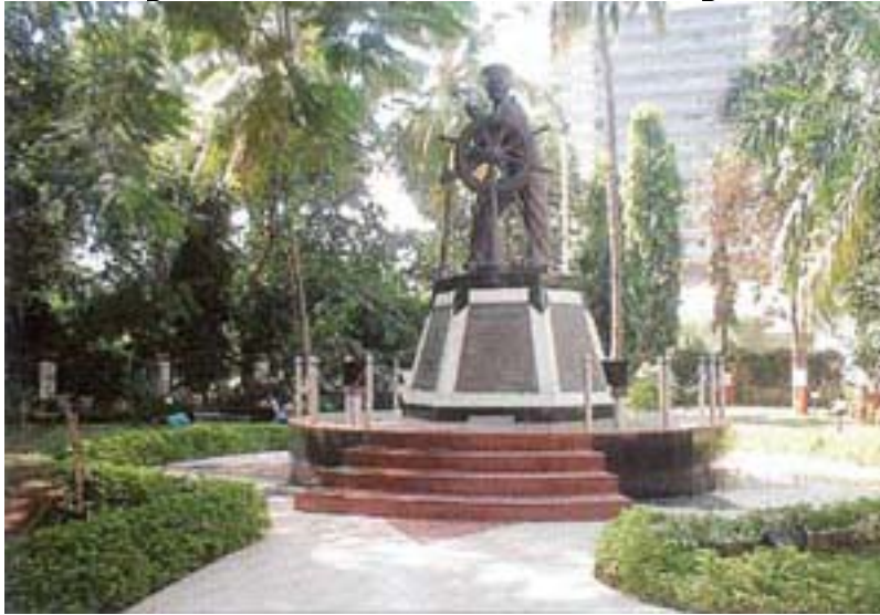
RIN Mutineer's Memorial in Mumbai.