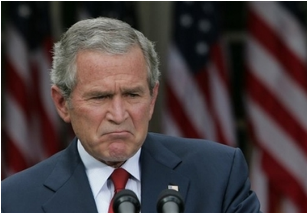
Sept. 15, 2006