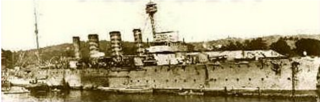
HMIS Talwar at Bombay Harbour.

The sailors were that evening alleged to have been served sub-standard food. Only 17 ratings took the meal, the rest of the contingent went ashore to eat in an open act of defiance . It has since been said that such acts of neglect where fairly regular, and when reported to senior officers present practically evoked no response, which certainly was a factor in the build up of discontentment.