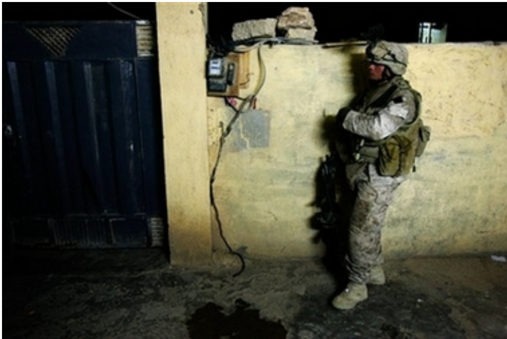
A U.S. Marine stands inside the courtyard of a house in Ramadi, June 28, 2006.

REALLY BAD IDEA: NO MISSION; HOPELESS WAR: BRING THEM ALL HOME NOW