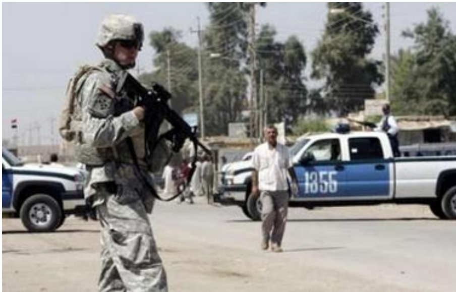
A U.S. soldier from the 1st Brigade Combat Team, 4th Infantry Division, in Baghdad September 16, 2006. (IRAQ)