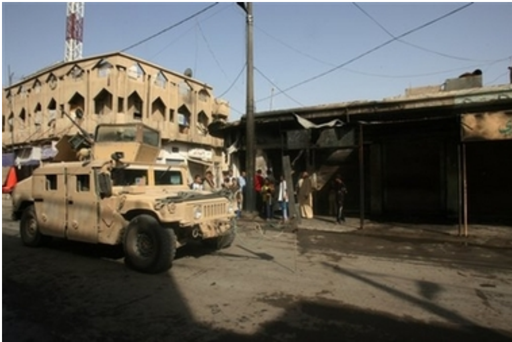
U.S. soldiers drive past the site of a car bomb explosion in Baghdad Sept. 21, 2006.