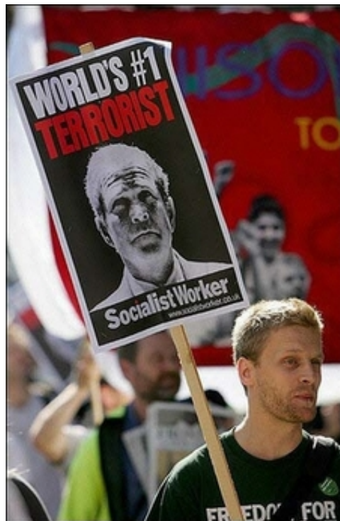
A protestor holds a poster of George W Bush in Manchester, on the eve of the governing Labour Party's annual conference.

A group of military families whose relatives have died in Iraq set up a peace camp in Manchester earlier this week and they were at the head of the march.