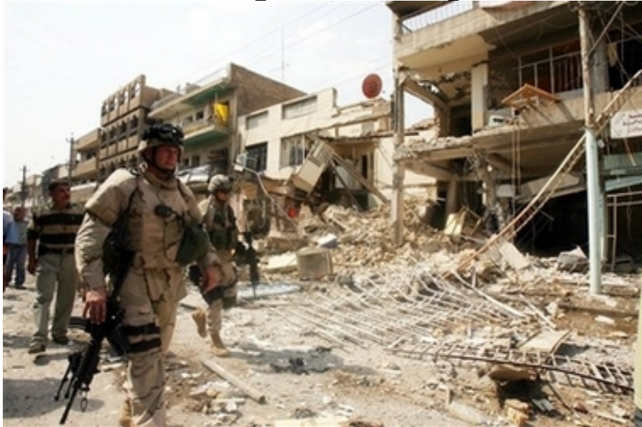
U.S. troops arrive at the site of a bomb blast in Baghdad's Camp Sara Oct. 4, 2006 after a series of bomb blasts went off in rapid succession in Baghdad.