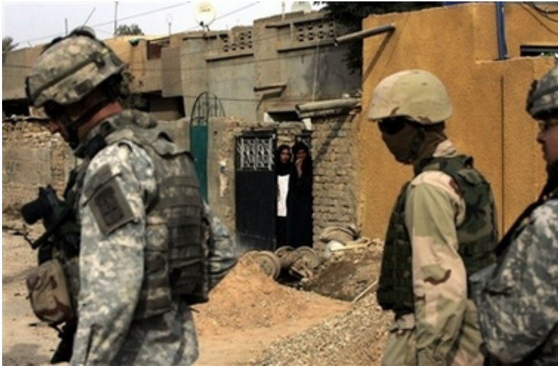
Iraqi citizens look at foreign occupation soldiers from U.S. Alfa company 1-17 battalion of the 172nd Stryker brigade combat team patrolling, in eastern Baghdad, Oct. 2, 2006.

Basra Occupation Under Siege: “Downtown Bases Are Now Being Rocketed Or Mortared Almost Every Night” “Foreign Troops Now Face Growing Threats Across The Spectrum Of Militia Activities”