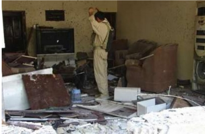
Police station damaged by a bomb attack in Hilla October 13, 2006.

October 13, 2006 Radio Free Europe & Reuters & Dave Clark (AFP)