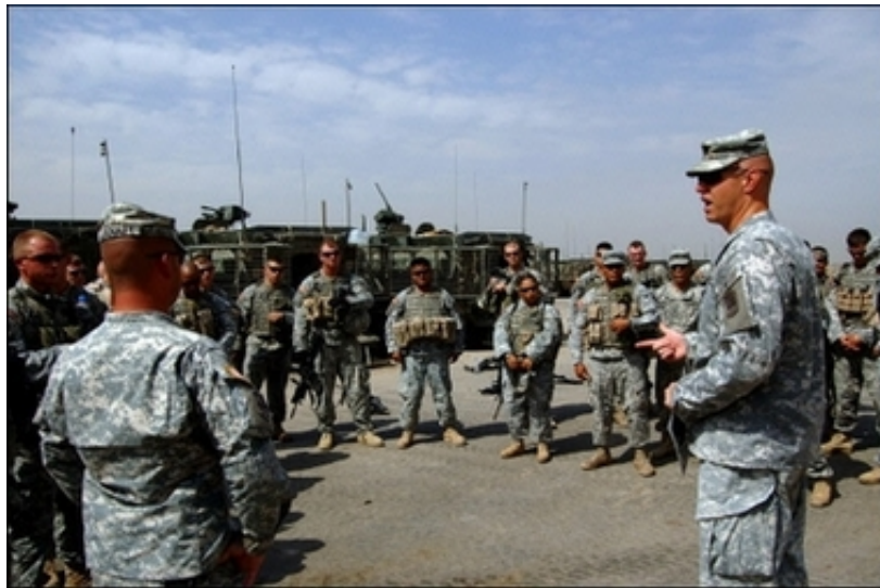
10.4.06: US officer briefs his troops before a patrol in east Baghdad.