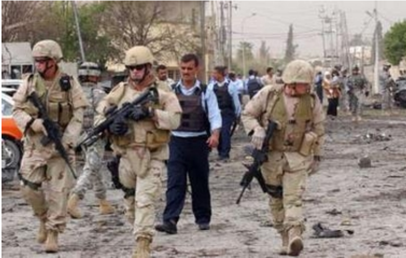
U.S. soldiers at the scene of a car bomb attack, which targeted a police patrol in Kirkuk, October 15, 2006.