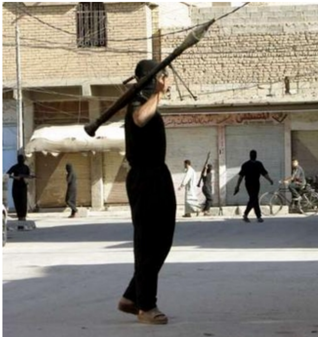
Insurgents on a road in Ramadi October 22, 2006. (IRAQ)

Anti-Occupation Mahdi Army Holding Amarah; Mopping Up Operations Continue