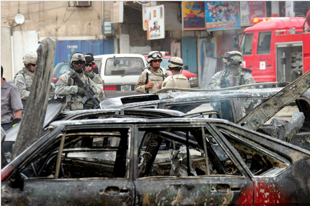
Baghdad, Oct. 14: U.S. soldiers at the site of car bomb explosions in a parking lot. Two bombs hidden in parked cars exploded Saturday.