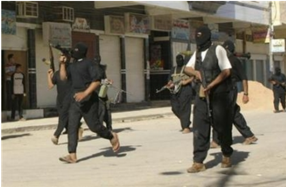
Insurgent soldiers patrol a road in Ramadi October 22, 2006.