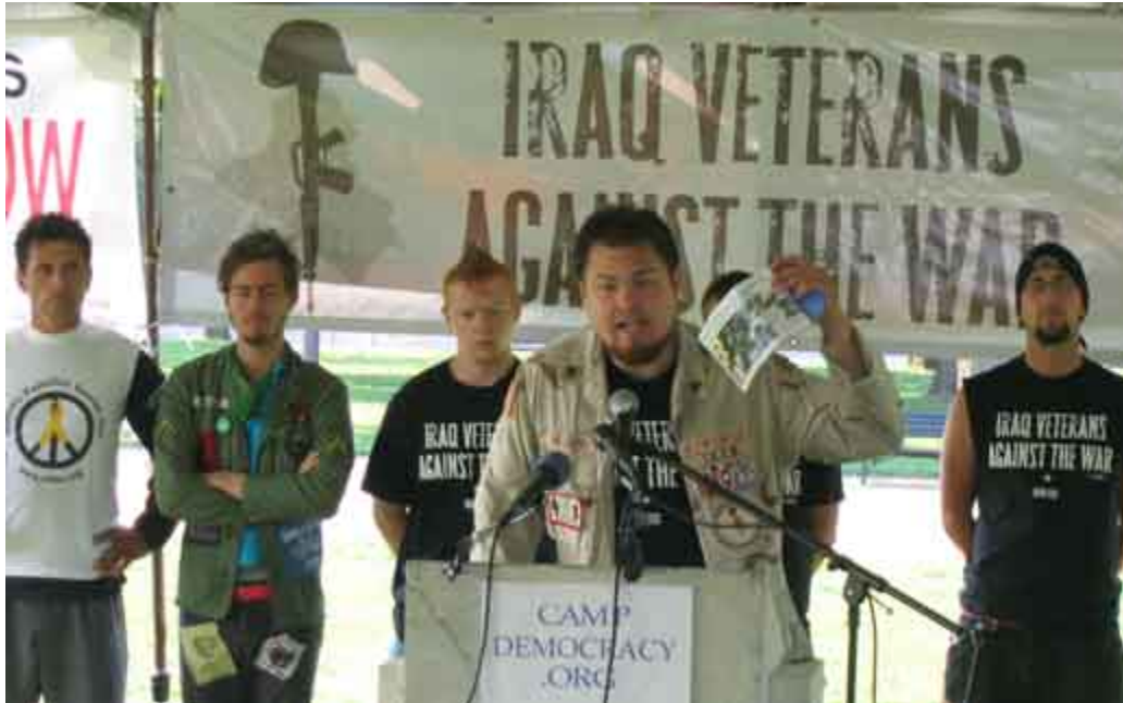
October 01, 2006: Photo from Veterans For Peace, Greater Atlanta Chapter 125