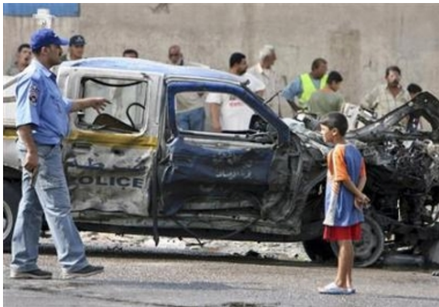
A destroyed police vehicle after a car bomb attack targeted a police patrol in Baghdad, October 2, 2006.

Guerrillas attacked a police checkpoint late on Monday, killing a police officer and wounding a policeman in Dour, near Tikrit, 175 km (110 miles) north of Baghdad, police said.