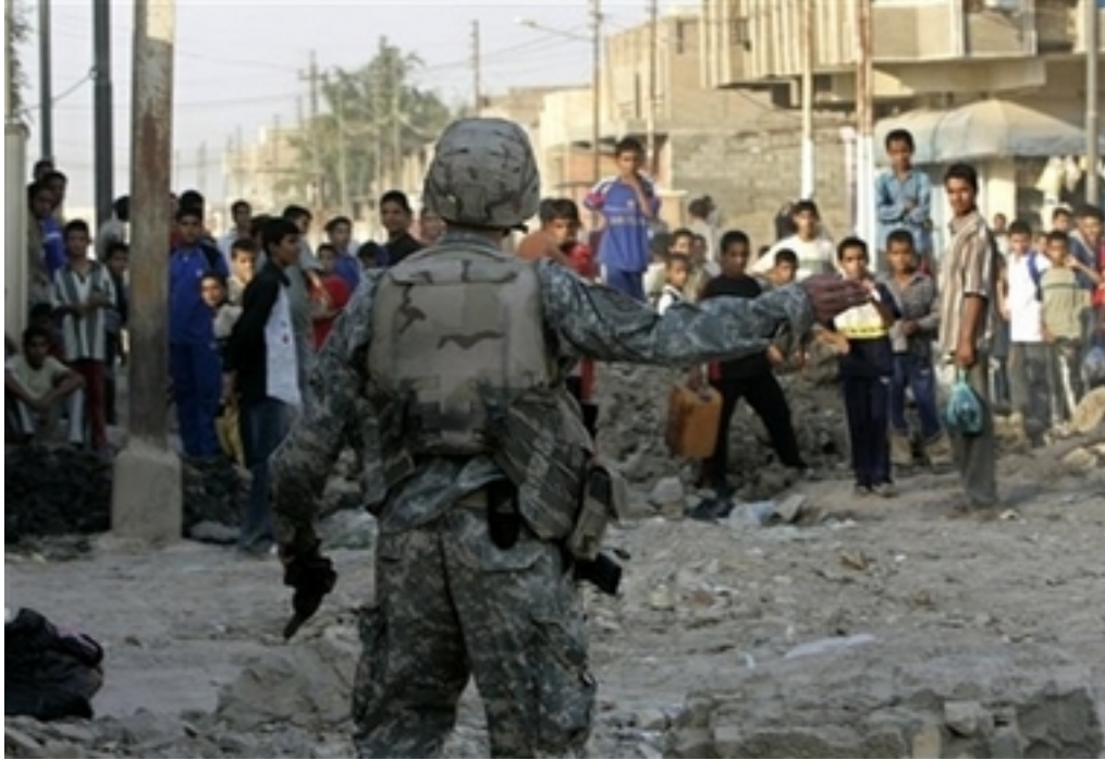
A U.S. soldier from Alfa company 1-17 regiment of the 172th brigade confronts Iraqi citizens, mostly children, gathering where a U.S. armored vehicle got stuck in a ditch, in eastern Baghdad, Oct. 3, 2006.