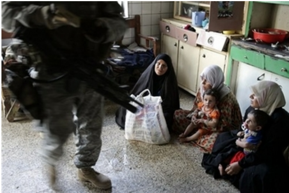
A foreign occupation soldier from U.S. Alfa company 1-17 regiment of the 172th brigade orders Iraqi women and children to sit on their kitchen floor while other occupation troops search through their personal belongings in their own home in eastern Baghdad, Oct. 3, 2006.