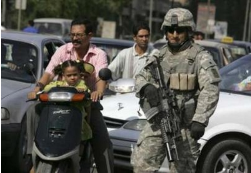
A U.S. soldier at a checkpoint in Baghdad, October 24, 2006. (IRAQ)