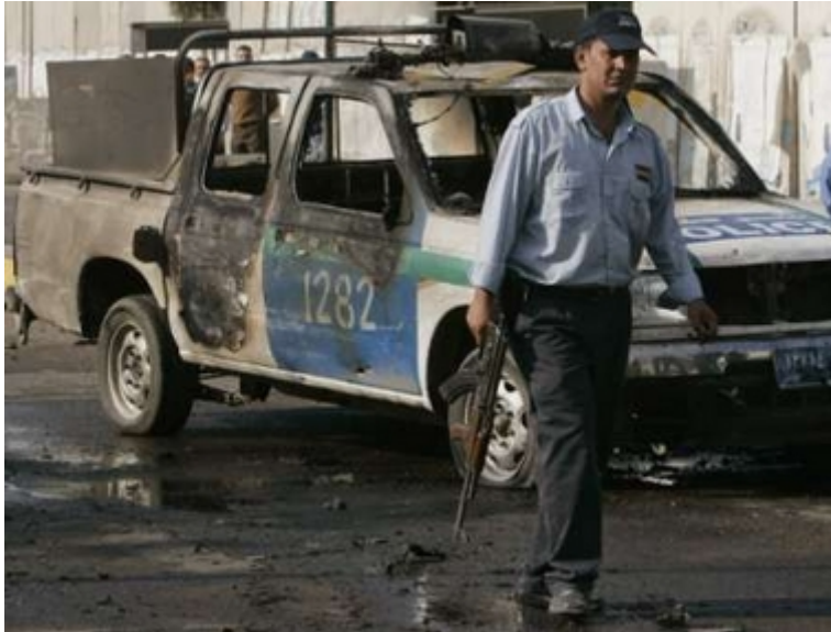
Police vehicle destroyed by a resistance car bomb attack, Baghdad, November 15, 2006.

Guerrillas ambushed a vehicle carrying a group of construction workers, killing two and wounding three, who were working at a police station and killed a traffic police officer in the oil city Kirkuk, 255 km (155 miles) north of Baghdad.