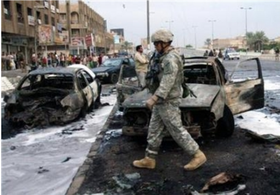
A U.S. soldier at the scene of a car bomb attack in Baghdad October 23, 2006.