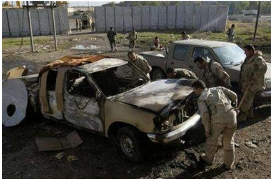
Army vehicle destroyed in a car bomb attack in Mosul November 18, 2006.

IF YOU DON'T LIKE THE RESISTANCE END THE OCCUPATION