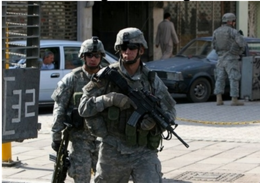
172nd Stryker Brigade Combat Team soldiers stop traffic approaching central Baghdad's Karradah district, Oct. 24, 2006. U.S. and Iraqi forces threw a security cordon around Karradah on Monday night and continued door-to-door searches Tuesday.