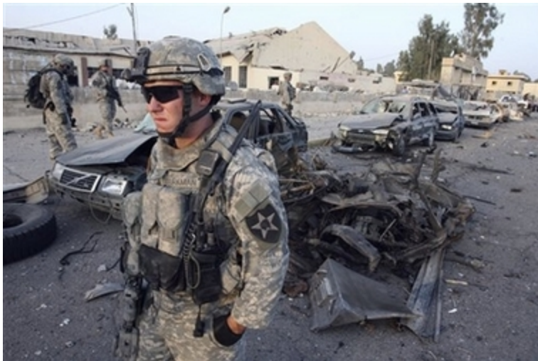
A U.S. Soldier on a street in Mosul, Iraq, following a truck bomb Oct. 19, 2006.

REALLY BAD IDEA: NO MISSION; HOPELESS WAR: BRING THEM ALL HOME NOW