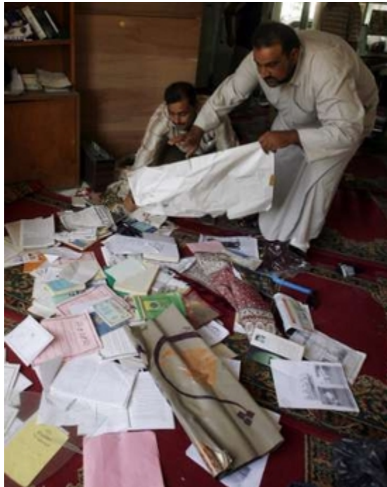
Iraqi citizens trying to pick up the pieces inside a Shi'ite mosque after a raid by the U.S. forces in Baghdad October 20, 2006 trashed the mosque, and knocked down part of the