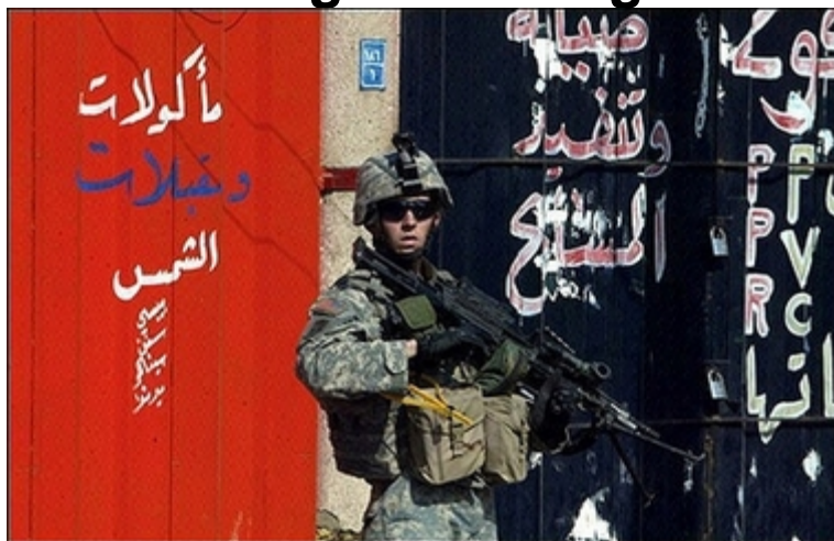
A US soldier at a snap checkpoint setup in Baghdad's Karada district.