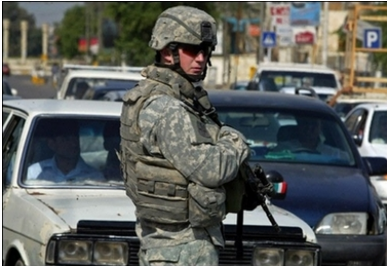
10.24.06: A US soldier at a snap checkpoint set up in Baghdad's Karada district.