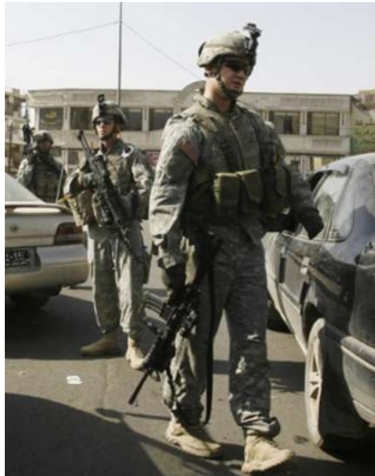
U.S. soldiers at a checkpoint in Baghdad October 24, 2006.