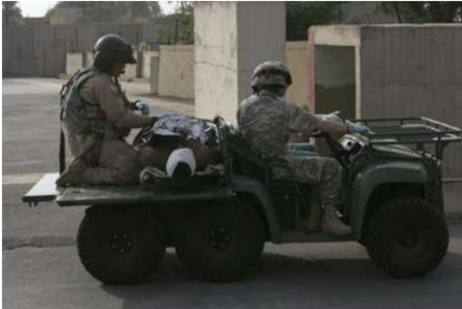
A wounded U.S. soldier lies on a vehicle after he was evacuated by a helicopter to a U.S. military hospital at the fortified Green Zone in Baghdad, October 30, 2006.

THIS IS HOW BUSH BRINGS THE TROOPS HOME: BRING THEM ALL HOME NOW, ALIVE