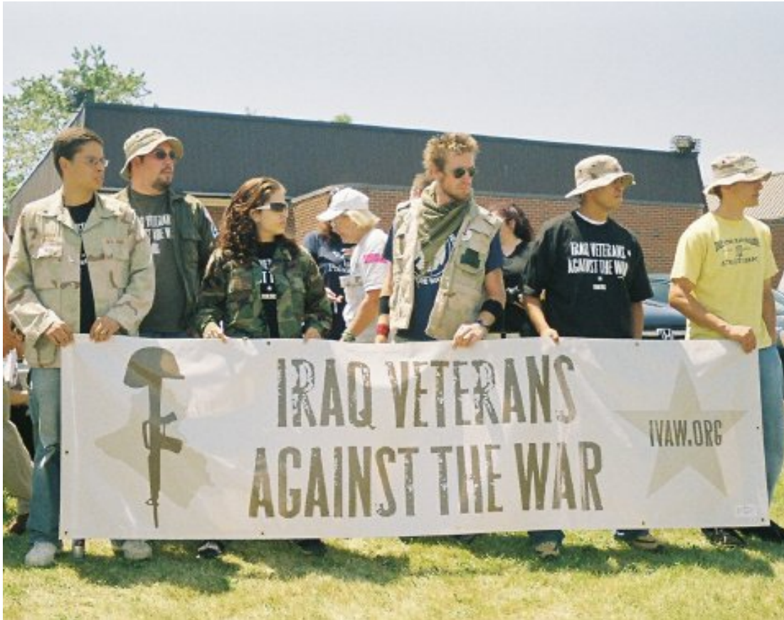
Fall 2006 The Veteran, Vietnam Veterans Against The War