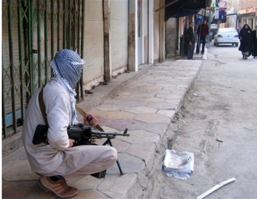
A guerrilla fighter takes position in central Ramadi Dec. 8, 2006.