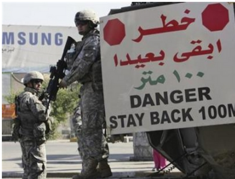
U.S. soldiers from the 172nd Stryker Brigade Combat Team stand guard at a checkpoint in Baghdad, October 27, 2006.