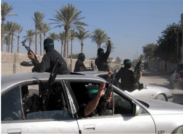
Armed militants drive through Ramadi Dec. 5, 2006. Ramadi, 70 miles west of Baghdad, is located in Anbar province, where many insurgent groups are based.