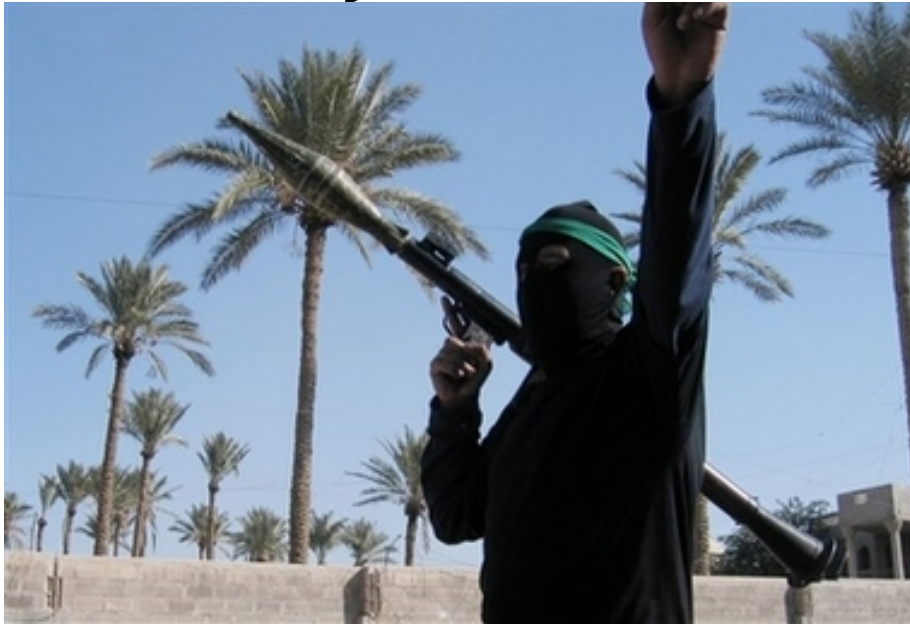
An armed insurgent in Ramadi, Iraq Dec. 5, 2006.