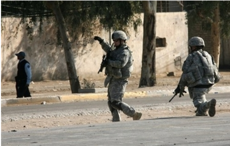
U.S. troops following an explosion in Baghdad Dec. 5, 2006. Two car bombs exploded near one another in western Baghdad.