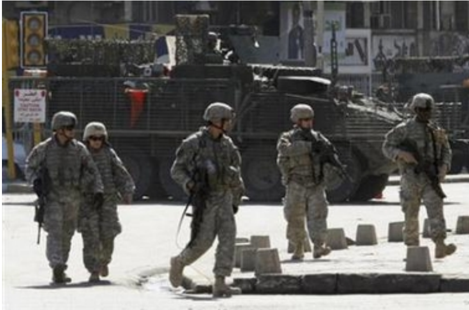
U.S. soldiers from the 172nd Stryker Brigade Combat Team patrol a road in Baghdad, October 27, 2006.