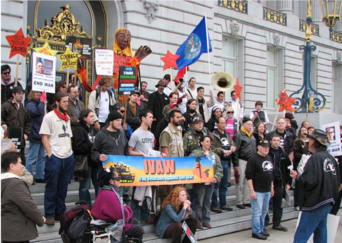
Vets and supporters gather on SF City Hall steps