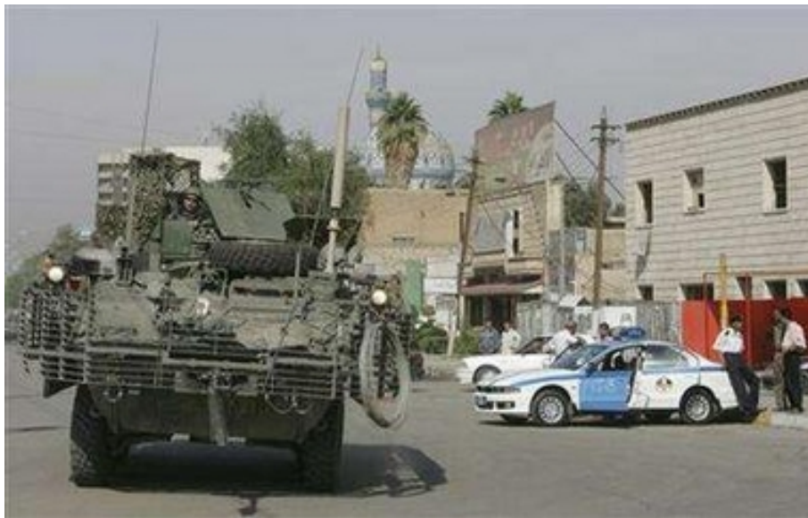
A U.S. armored vehicle patrols a road in Baghdad October 28, 2006.