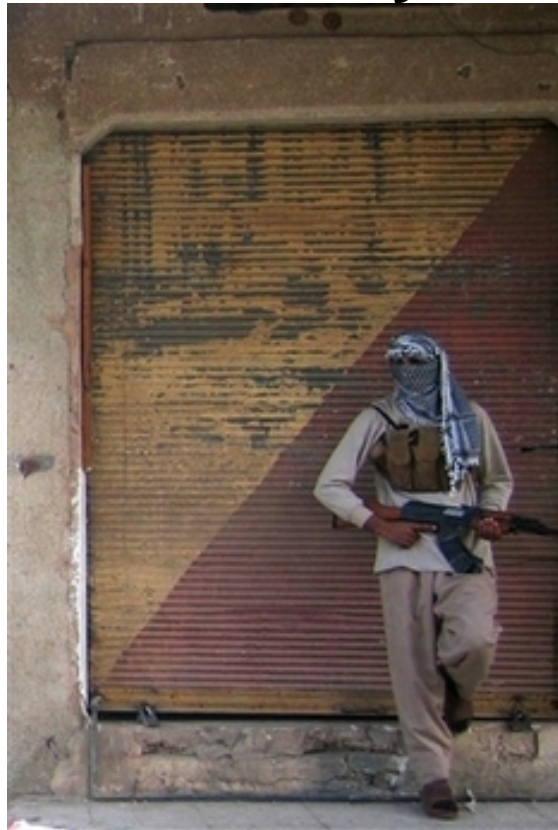
A insurgent soldier stands guard in central Ramadi Dec. 8, 2006.

Guess Who Doesn't Need U.S. Military Trainers: Guess Who's Already Standing Up