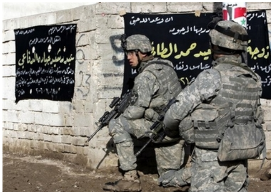
U.S. soldiers from the 5th Battalion, 20th Infantry Regiment look on during an anti-American [translation: anti-Bush military dictatorship] demonstration in Baghdad, Dec. 25, 2006. Soldiers went house to house searching, touching off a protest that forced them to cut the mission short in some parts of the city.