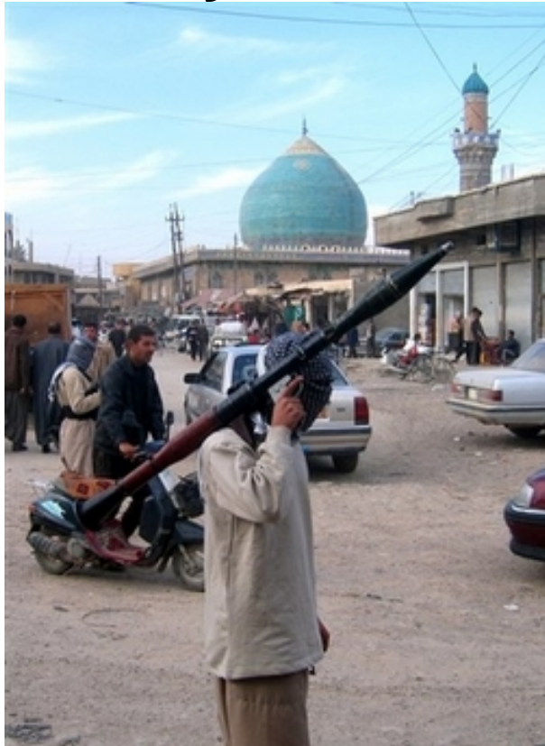
A militant armed with a rocket launcher patrols central Ramadi Dec. 8, 2006.

So Much For All That "Sovereign" Iraq Bullshit: U.S. Military Dictatorship Arrests Guests Of Iraqi "President"