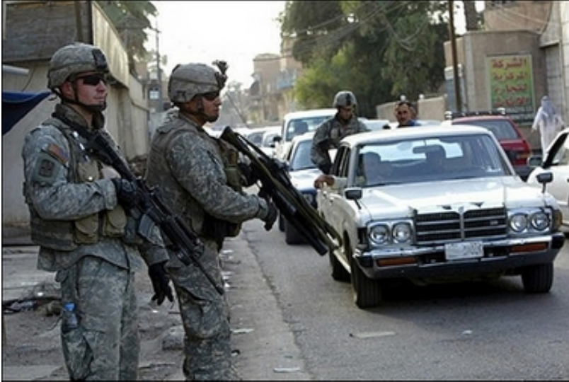
10.28.06: US soldiers man a spot checkpoint setup around the Karada neighborhood in central Baghdad.