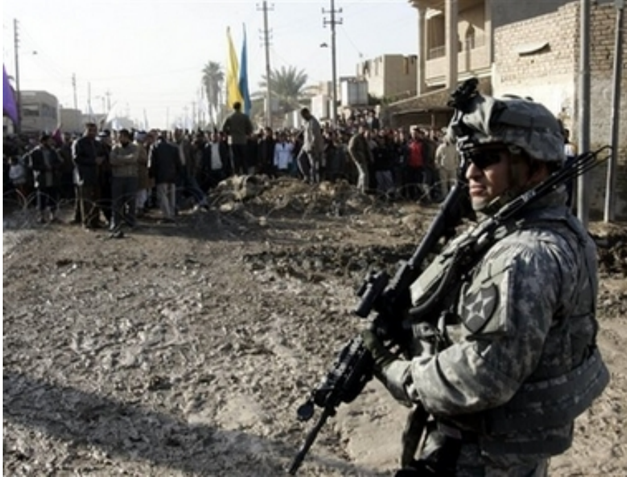
A U.S. soldier from the 5th Battalion, 20th Infantry Regiment looks on during an anti-American [translation: anti-Bush military dictatorship] demonstration in Baghdad, Dec. 25, 2006. Soldiers went house to house searching, touching off a protest that forced them to cut the mission short in some parts of the city.