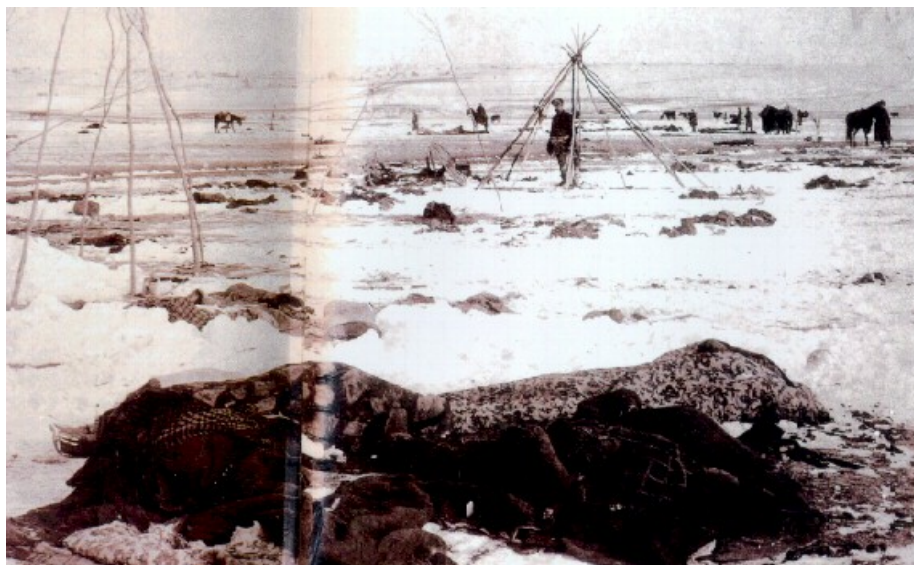
Indian Bodies on the ground at Wounded Knee