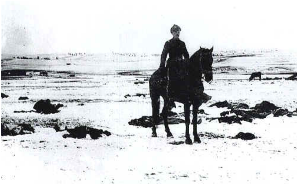
A mounted soldier rides among the dead Indians at Wounded Knee

[Via Peace History December 25-31 By Carl Bunin]