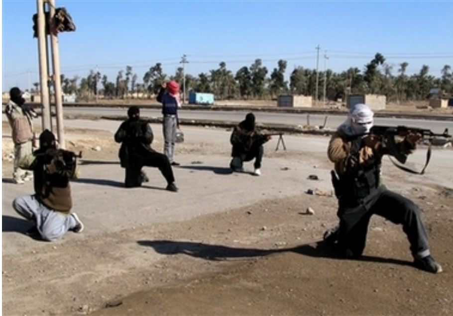
Armed anti-occupation fighters take up defensive positions on the side of a road on the outskirts of Baqouba, 60 kilometers (35 miles) northeast of Baghdad, Iraq, Dec. 28, 2006.

Dozens of masked gunmen paraded in the Gatoun district of Baqouba, a city that often has considerable amounts of insurgent activity.