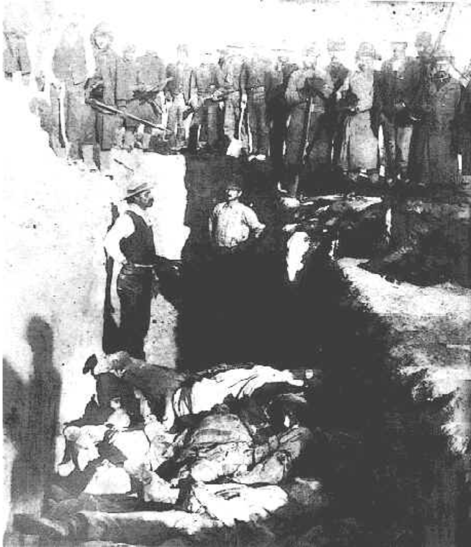
The mass grave at Wounded Knee