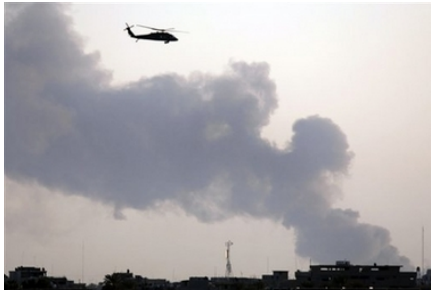
Dec. 28, 2006: An oil pipeline linked to the al-Dora refinery was blown up by guerrillas in Al-Adwanyaa district in Youssifiyah.

28 Dec 2006 Reuters & Aljazeera & Agence France Presse