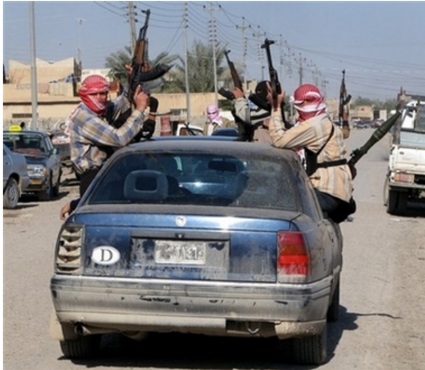
Armed anti-occupation fighters driving in a car on the outskirts of Baqouba, 60 kilometers (35 miles) northeast of Baghdad, Iraq, Dec. 28, 2006.

Dozens of masked gunmen paraded in the Gatoun district of Baqouba, a city that often has considerable amounts of insurgent activity.