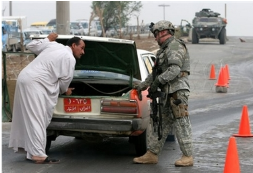
172nd Stryker Brigade Combat Team soldier inspects a car at a checkpoint on the edge of Baghdad's Sadr City, Oct. 26, 2006.