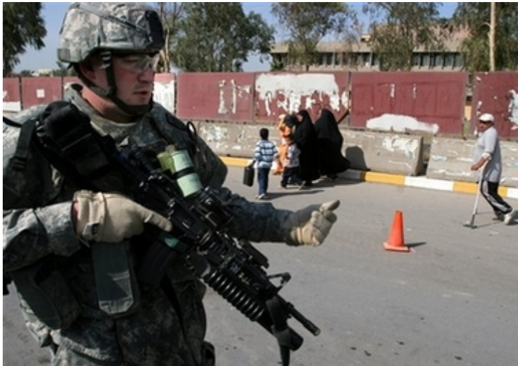
U.S. soldier at a checkpoint on the edge of Baghdad's Sadr City, Oct. 28, 2006.