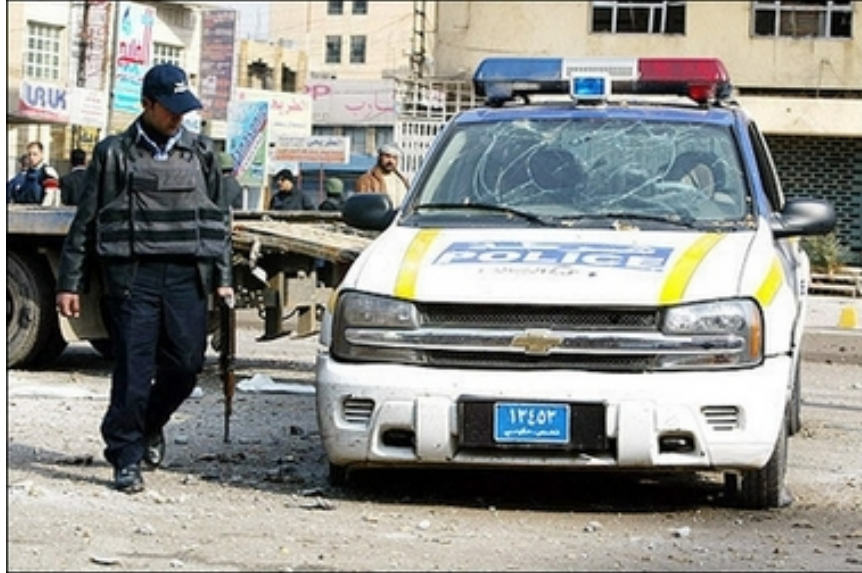
A shrapnel-riddled police car where a roadside bomb targeted a police patrol in Baghdad.