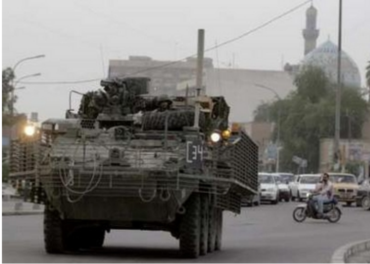
U.S. armoured vehicle on a road after abandoning their checkpoint in Baghdad October 31, 2006. REUTERS/Namir Noor-Eldeen (IRAQ)