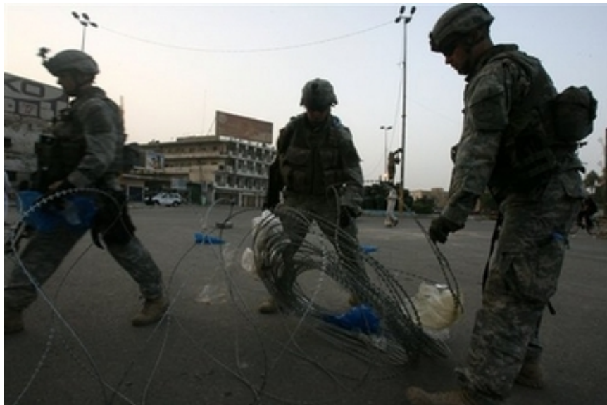
U.S. soldiers wind up barbed wire in central Baghdad's neighborhood Karradah Oct. 31, 2006