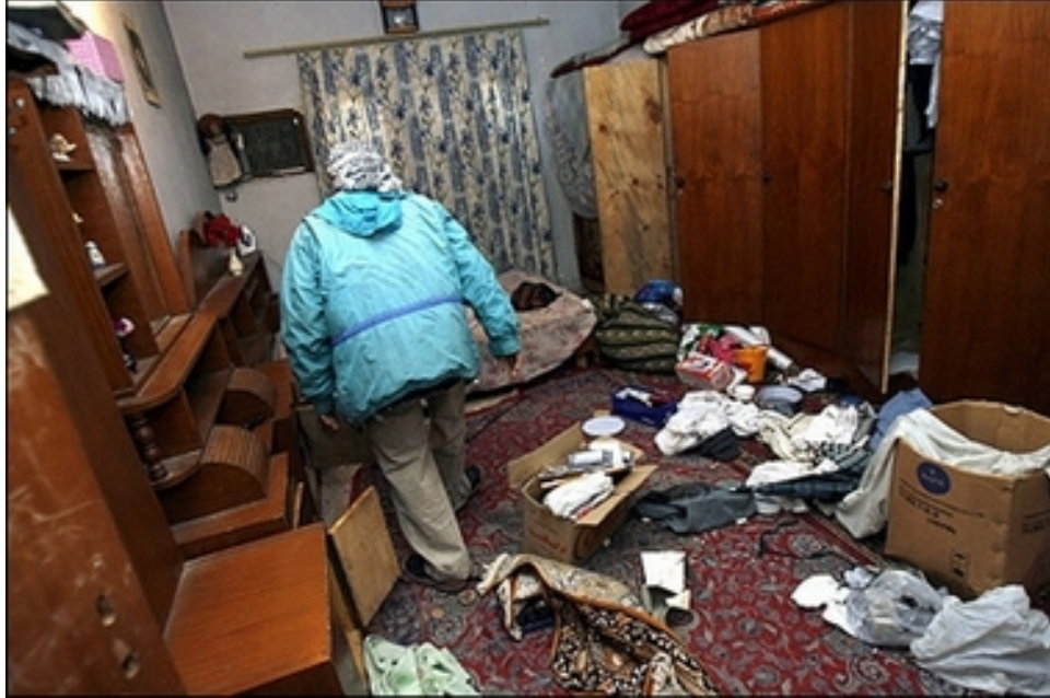
An Iraqi citizen inspects damage inside the Hussainiya mosque in central Baghdad, following a raid by US troops.

[Fair is fair. Let's bring 150,000 Iraqi troops over here to the USA. They can kill people at checkpoints, bust into their churches and houses with force and violence, butcher their families, overthrow the government, put a new one in office they like better and call it "sovereign," and "detain" anybody who doesn't like it in some prison without any charges being filed against them, or any trial.]