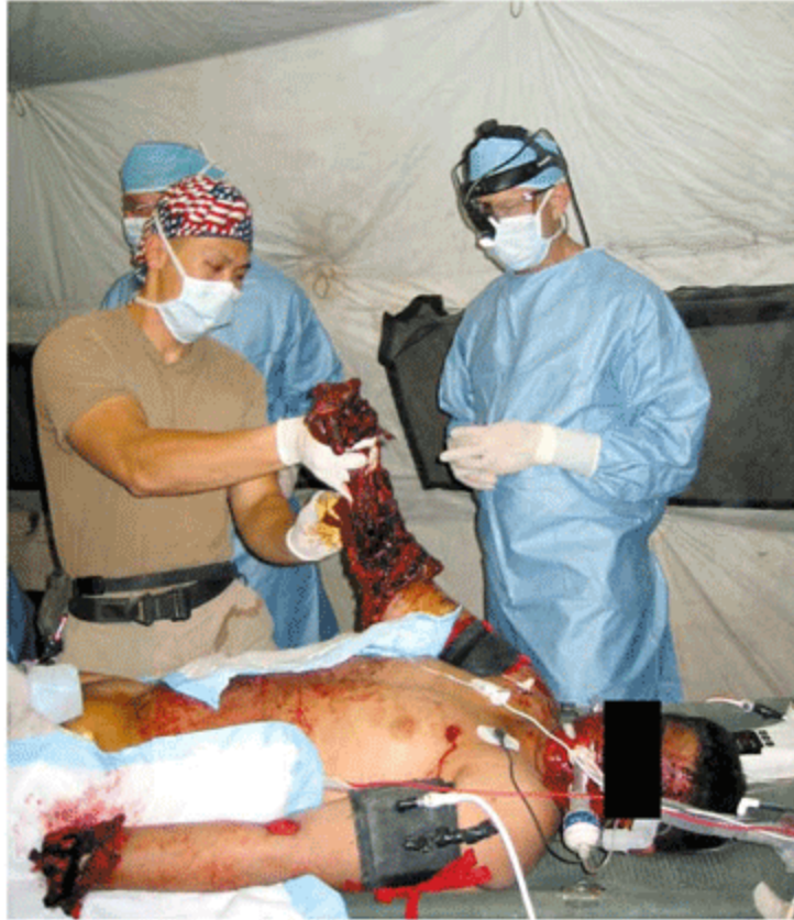
New England Journal of Medicine