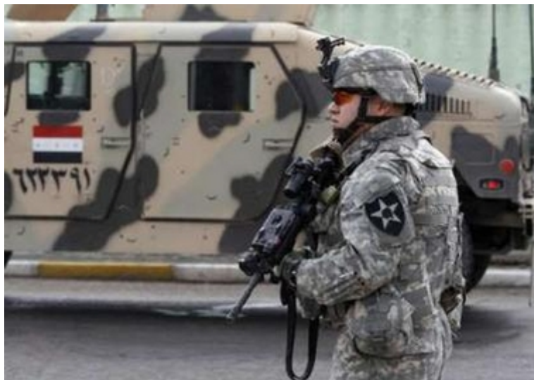
A U.S. soldier at a checkpoint during a curfew in Baghdad November 5, 2006.

REALLY BAD IDEA: NO MISSION; HOPELESS WAR: BRING THEM ALL HOME NOW