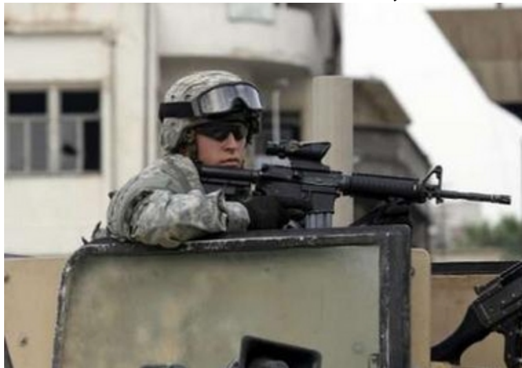
A U.S. soldier during a curfew in Baghdad November 5, 2006.

THIS ENVIRONMENT IS HAZARDOUS TO YOUR HEALTH; TIME TO COME HOME, NOW