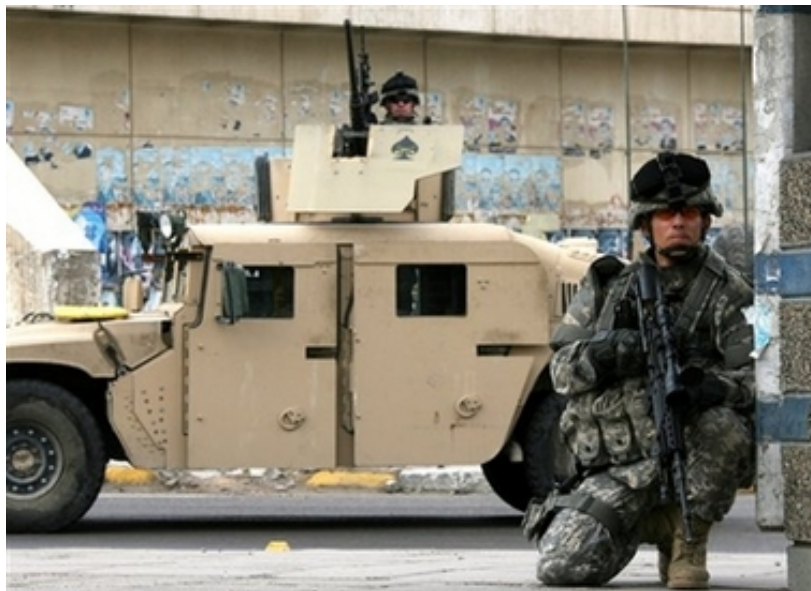
Soldiers patrol in central Baghdad Nov. 5, 2006.