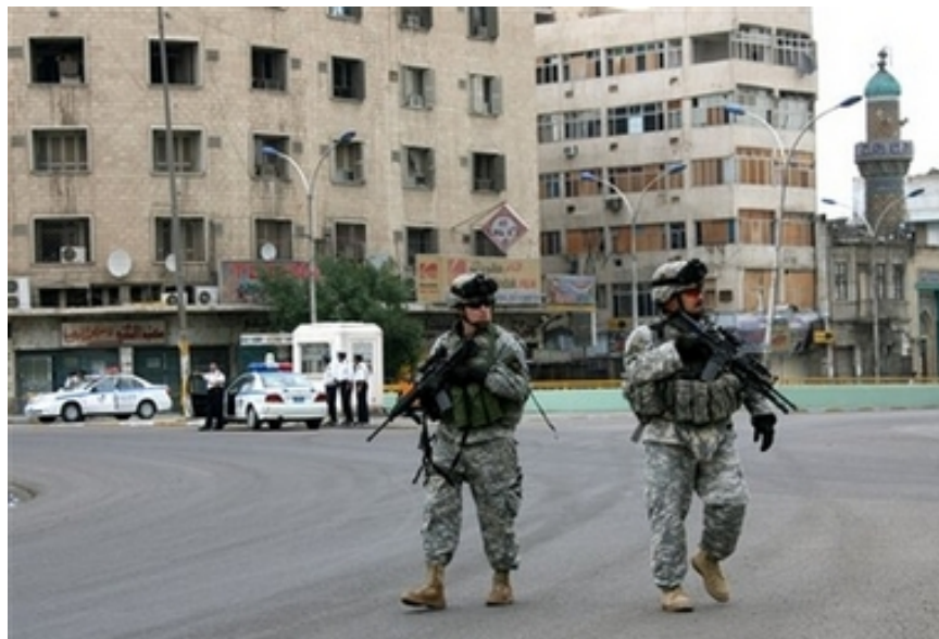
U.S. soldiers patrol in central Baghdad Nov. 5, 2006.