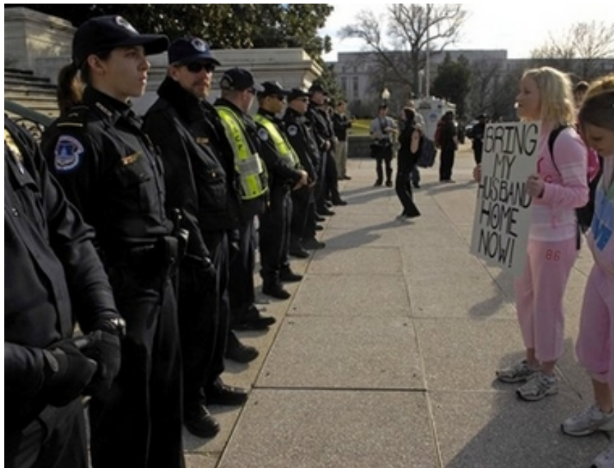
The unidentified wife of an Army Ranger serving in Iraq holds a sign near the U.S. Capitol during a protest against the war in Iraq Jan. 27, 2007 in Washington.