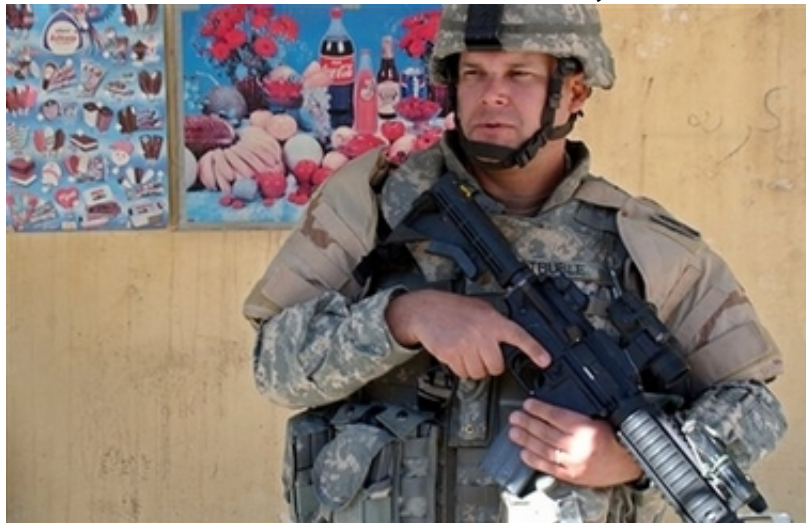
A US soldier standing outside a shop in Tal Afar, Iraq, Nov. 11, 2006.