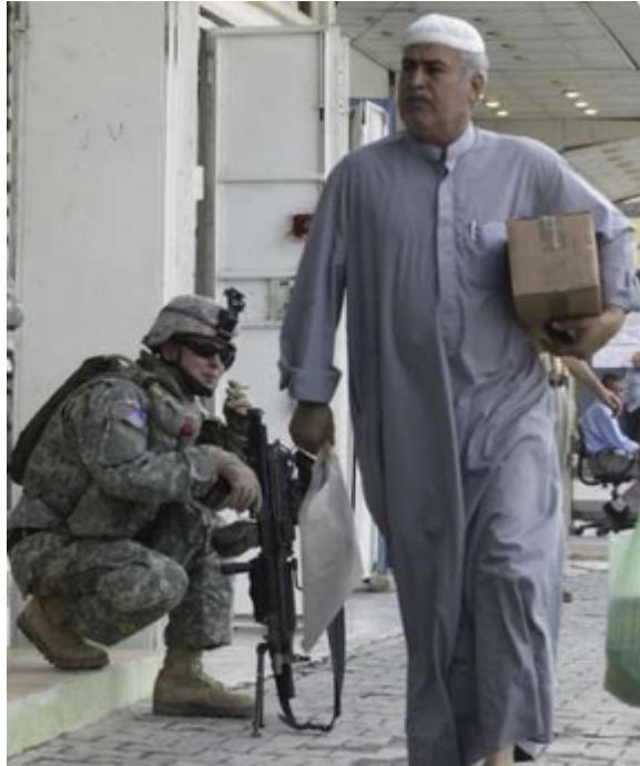
A U.S. soldier from the 172nd Stryker Brigade Combat Team guarding a street in Baghdad, October 29, 2006.