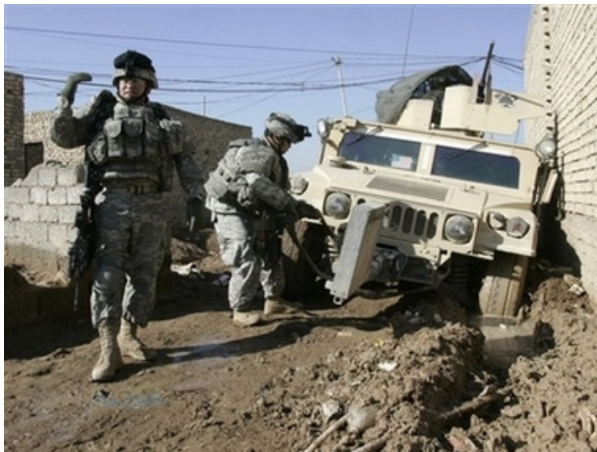
U.S. Army soldiers from the 2nd Battalion, 17th Field Artillery Regiment work to get a Humvee released from the mud in Baghdad Jan. 1, 2007