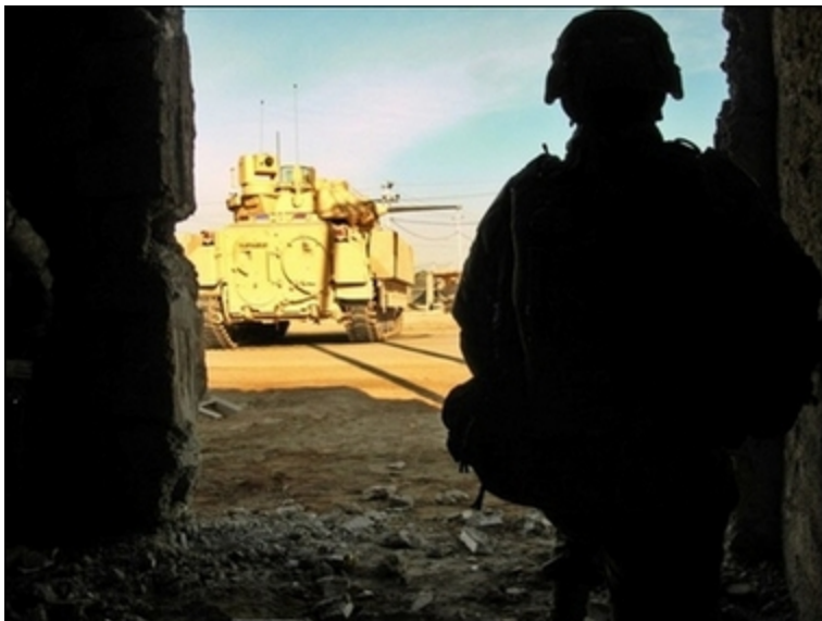
A US soldier during a raid on Baquba in December 2006.