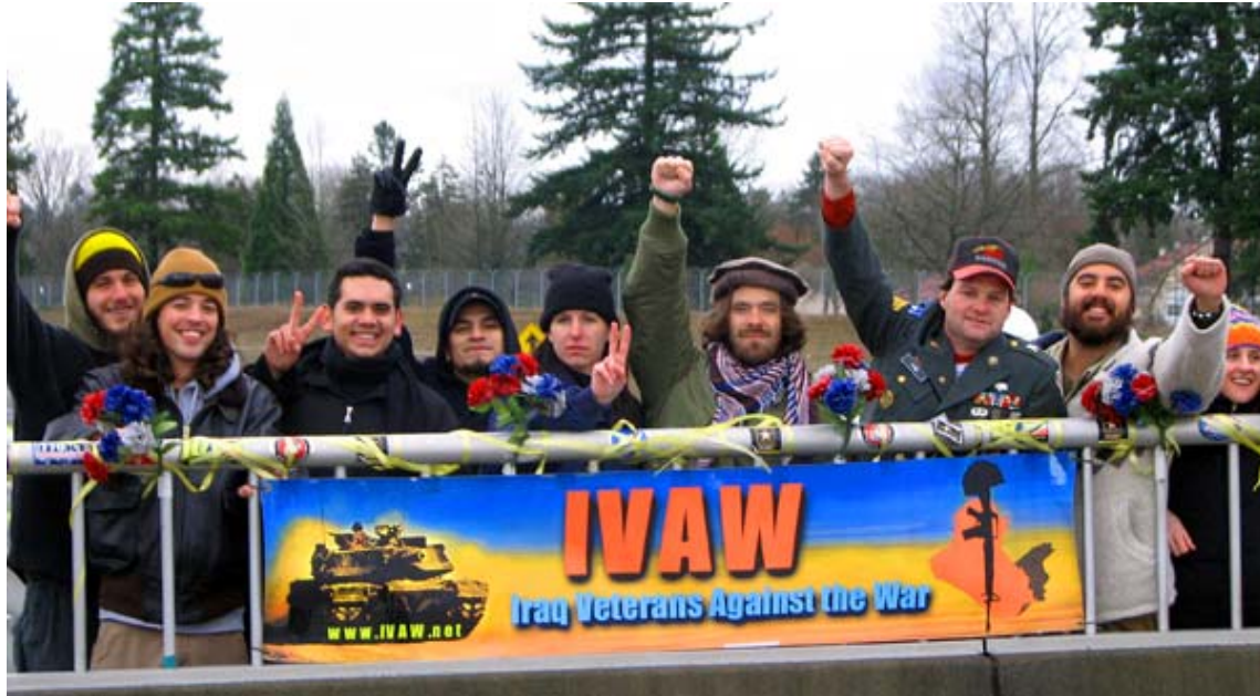
Iraq Veterans Against the War At Ft. Lewis. Jan 6th, 2007