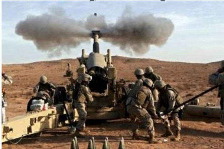
U.S. Marines from 3rd Battalion, 12th Marine Regiment in western Al Anbar Province December 21, 2006.

THERE IS ABSOLUTELY NO COMPREHENSIBLE REASON TO BE IN THIS EXTREMELY HIGH RISK LOCATION AT THIS TIME, EXCEPT THAT A TRAITOR WHO LIVES IN THE WHITE HOUSE WANTS YOU THERE That is not a good enough reason