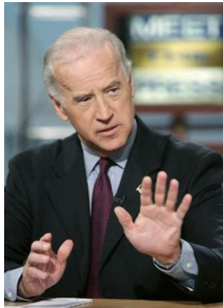
Danger: Shit-Mouthed Liar At Work