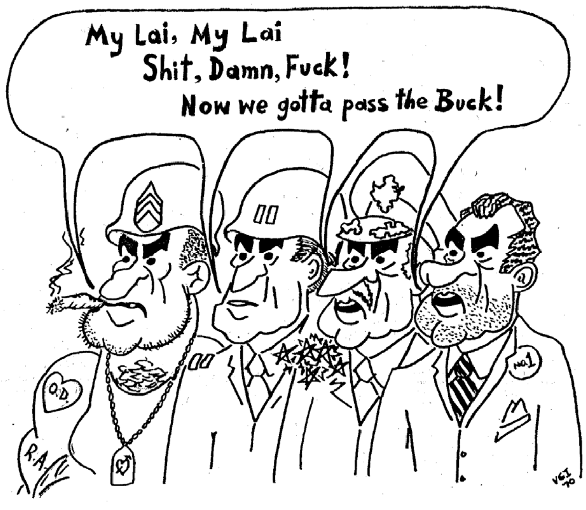
[Vietnam GI, June 1970]