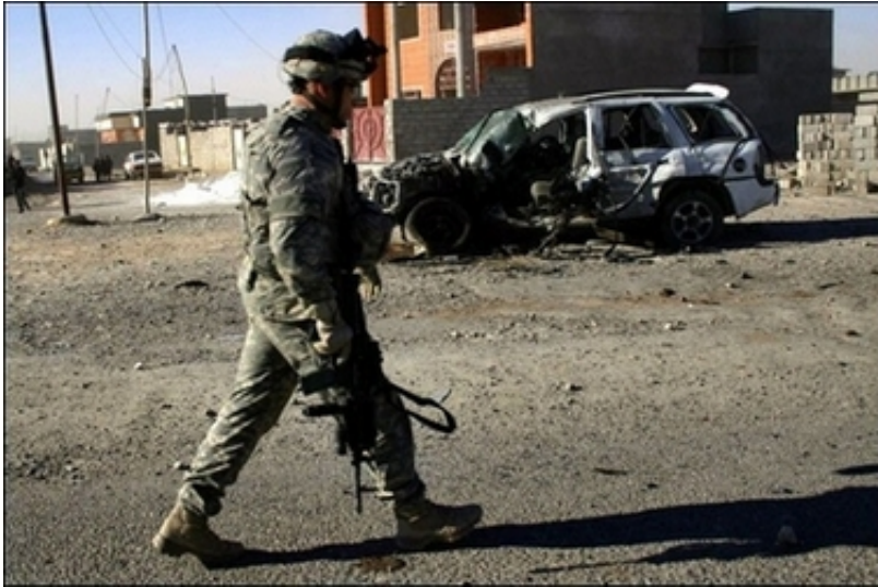
12.3.06 A US soldier at the site of a bombing in Kirkuk.