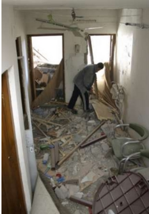
A resident sifts through the rubble of a destroyed house after a bomb attack in Falluja, February 12, 2007. A policeman for the occupation who lived in the house was captured by insurgents before they set off the bomb, family members said.