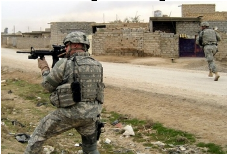
A U.S. army soldier provides cover fire for a fellow serviceman during a raid in Buhriz, north of Baghdad Feb. 11, 2007.

THERE IS ABSOLUTELY NO COMPREHENSIBLE REASON TO BE IN THIS EXTREMELY HIGH RISK LOCATION AT THIS TIME, EXCEPT THAT A TRAITOR WHO LIVES IN THE WHITE HOUSE WANTS YOU THERE That is not a good enough reason