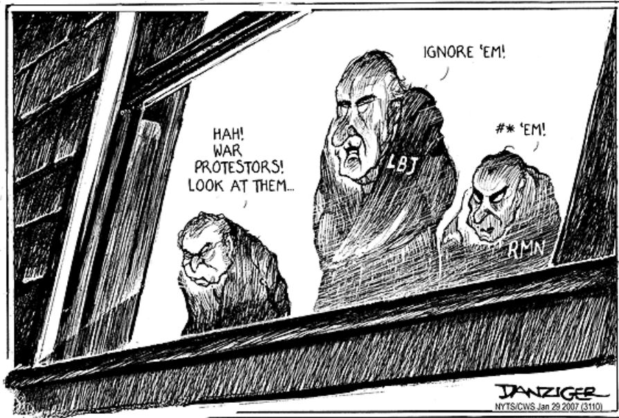
Helpful Advice from Past War Presidents