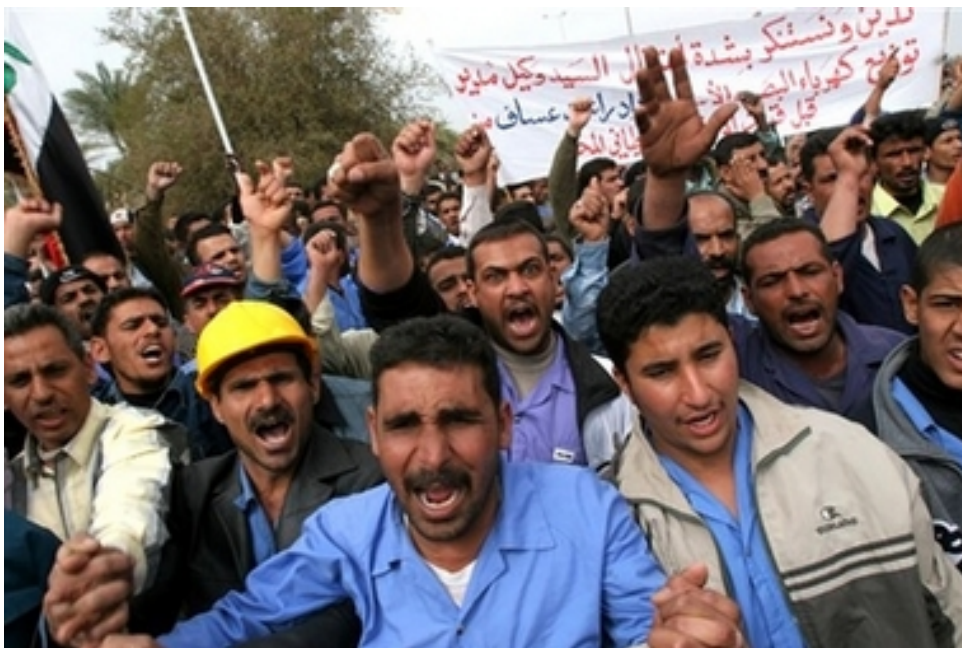
Iraqis protesting in Basra Feb. 13, 2007. About 500 people launched a sit-in strike in front of the British Consulate in Basra in protest against the arrest of the