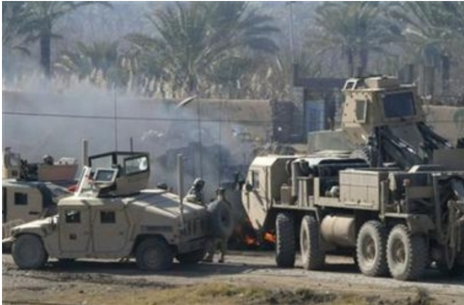
U.S. military vehicles surround the scene of a roadside bomb attack in Baquba, January 23, 2007. The attack targeted a U.S. convoy.