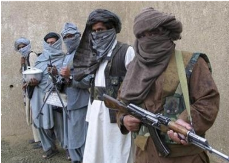
Taliban guerrilla fighters at a secret base in eastern Afghanistan February 3, 2007.