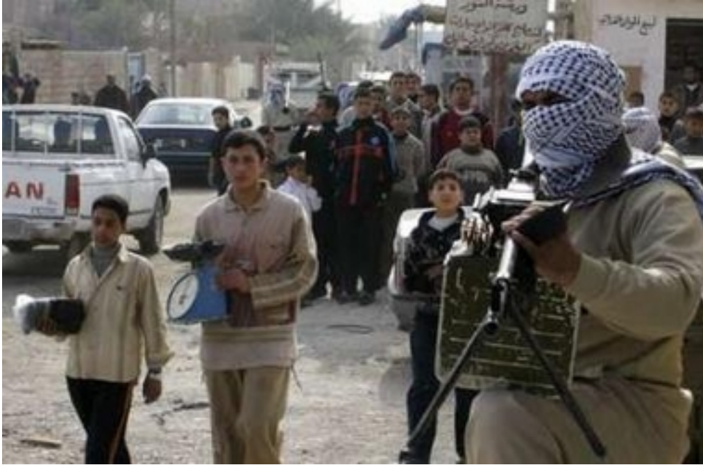
An insurgent armed with a heavy machinegun stands at a street in the centre of the Iraqi town of Ramadi December 8, 2006.

GUESS WHO DOESN'T HAVE TO WATCH HIS BACK: COULD IT BE THOSE FOLKS IN THE PHOTO WITH HIM THINK HE'S ON THEIR SIDE? THEY DON'T EXACTLY LOOK "TERRORIZED," DO THEY?