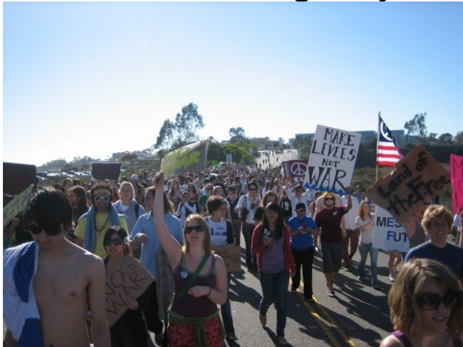
From UCSB: students marching onto the highway!

Feb 15, 2007 By VoteHarder, Daily Kos [Excerpts]