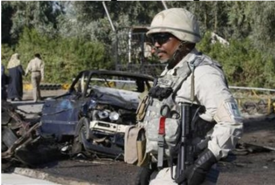
A U.S. soldier walks past destroyed cars after a car bomb attack in Baghdad, November 16, 2006.

THERE IS ABSOLUTELY NO COMPREHENSIBLE REASON TO BE IN THIS EXTREMELY HIGH RISK LOCATION AT THIS TIME, EXCEPT THAT A TRAITOR WHO LIVES IN THE WHITE HOUSE WANTS YOU THERE That is not a good enough reason