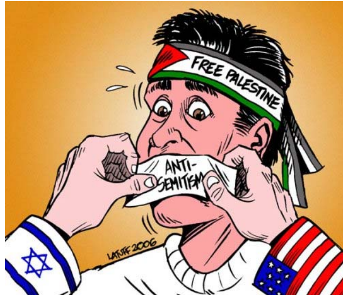
by Carlos Latuff

And the most sickening thing of all is to pass through them. But because the Palestinians have no alternative but to continue to pass through them, these checkpoints will continue to be the representatives of Israeli society.