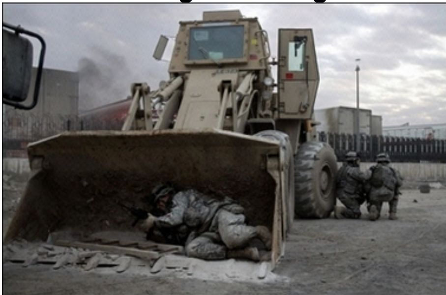
2.16.07: A US soldier takes cover in the shovel of a bulldozer during a sustained gunfight in northern Baghdad.