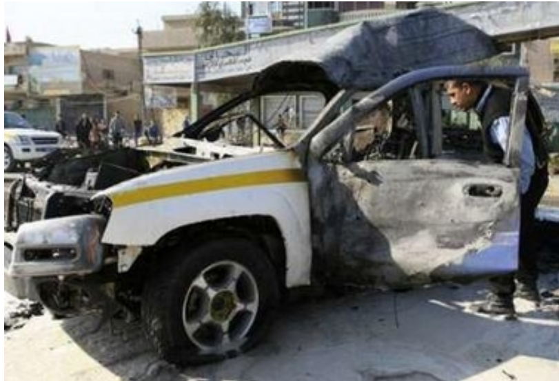
A destroyed police vehicle after a bomb attacks in Baghdad, February 19, 2007.